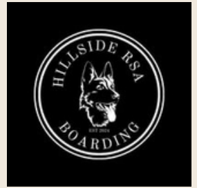
Photo & Video Release Form

Thank you for choosing Hillside RSA Boarding! As part of our commitment to providing exceptional service, we occasionally capture special moments with your pets to share the joy with our community.